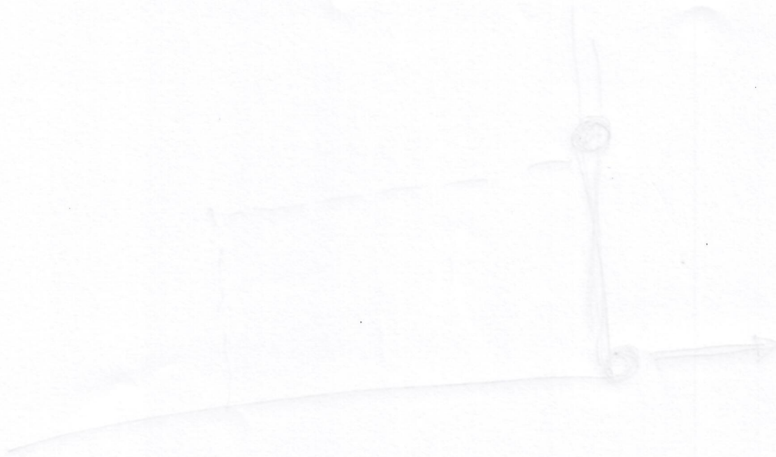
EXHIBIT A Evidence of Bond