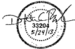
EXHIBIT ATTACHED AND MADE A PART HEREOF.